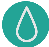
Bleeding or bruising easily