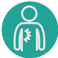
Swollen spleen or liver

You might not have any symptoms when you are first diagnosed. But you might get signs and symptoms over time, which could include: