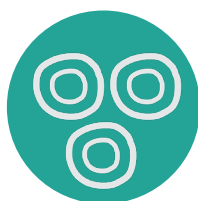
Low red blood cell count (anaemia)