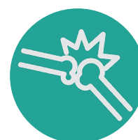
Joint or bone pain